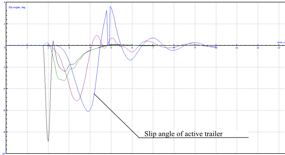
Fig. 2. Time-based sideslip angle dependence: turning of road train with active trailer.