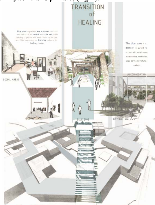
Fig 2. Student project in which threshold taken in consideration as a privacy separator.

In another student project; there is a blue zone. This blue zone separates the functions into two main axis such as social and medical axis, divide building to private and public parts. Blue zone is a doorway for patient to heal with social areas, accomadation, meditation,yoga parts and natural walkway. With the blue zone project is divided into zones according to public, semi public and private, (fig 2).