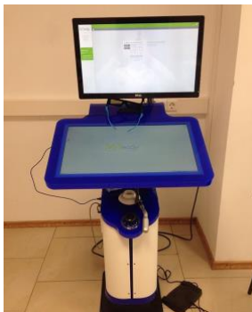
Fig. 1. “VirTeaSy Dental”.

includes glasses for work and software. The position of the trainee on the simulator can be controlled by pneumatic control (Figure 1).