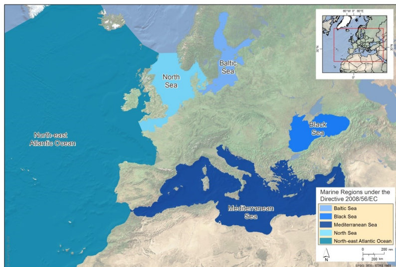
Fig. 3. Sea basins analysed under MUSES project (drawing on [1])

It is evident that MUs might differ in the EU sea basins due to their specific features facilitating development of some uses and hindering others. Five distinctive sea basins are defined in the EU sea waters if the outermost regions are not included: the North-Eastern Atlantic (EA), the North Sea (NS), the Baltic Sea (BSR), the Mediterranean Sea (Med) and the Black Sea (BS) (Fig 3). Each of these sea basins is characterized by different physical conditions resulting in different uses of sea resources. However, despite obvious differences, several common trends important for MU development are observed: 1) sectors dominating in the given sea basin seem to strongly influence development of MU, 2) environmental assets tend to have a more important role in allocation of the sea space to particular uses, 3) local and regional economic development is a driving force for local MU initiatives.