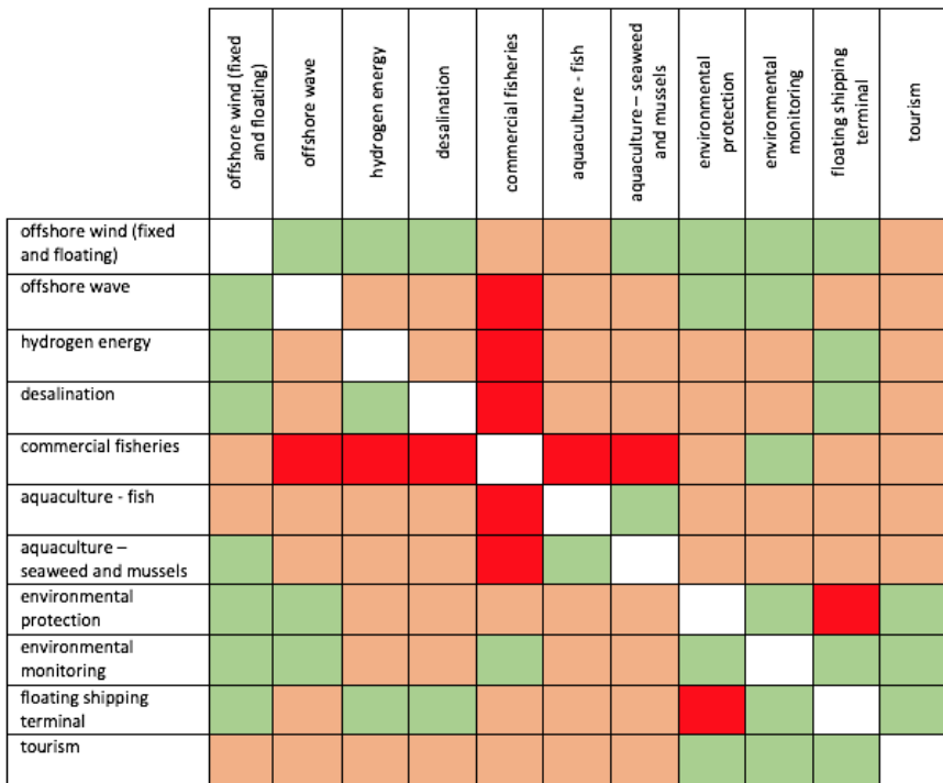
Figure 2. illustrates that combinations may differ in terms of their potential/feasibility and time of appearance. Some of them are very probable in the near future, some may be possible in several years’ time, and others are not likely to occur at all. However, this matrix is indicative of the complexity of the MU research.