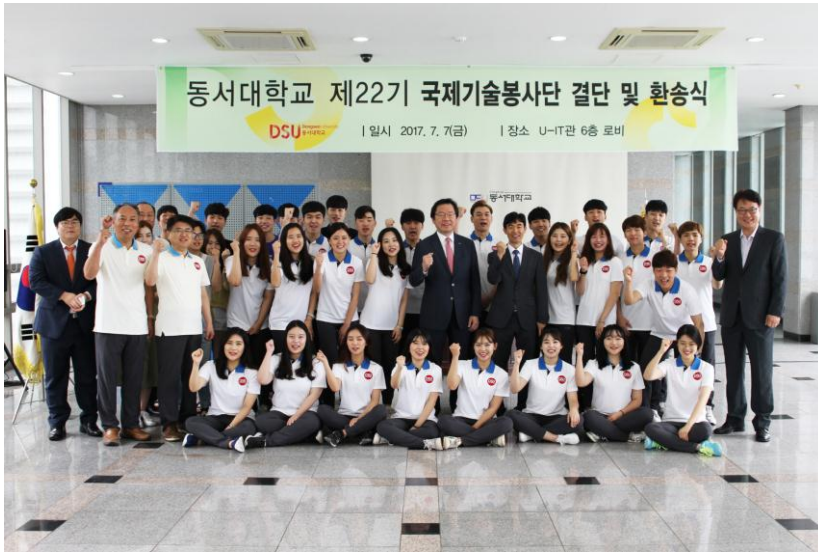
Fig. 1. Ceremony for departing team of the 22nd International Tech Corps (2017.07.07).

community involvement and interaction. Since the program’s inception, Dongseo has continued to recruit participating students through open applications. So far approximately 600 Dongseo University students have benefited through their volunteer service experiences in the International Tech Corps, including teams of roughly 30 students sent annually over the past 5 yr. Figure 1 shows the team from 2017 prior to their departure to volunteer in six different Indonesian villages.