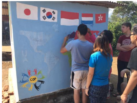
Fig. 4. International collaboration.