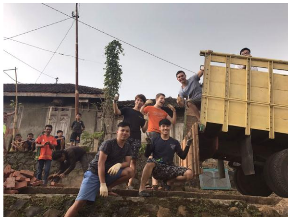
Fig. 2. Infrastructure development project.

Figures 2 to Figure 5 illustrate some types of service-work conducted by the 22nd International Tech Corps team during their month-long stay in Indonesia.