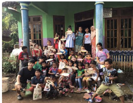
Fig. 5. Community outreach.

Dongseo students who are selected receive training throughout the semester after deciding which type of service they intend to provide. They may choose among the following fields. First , education. The student volunteers teach Taekwondo, computer skills, English, Science, balloon art, make-up, nail art, skin care, etc. This field is very popular with local children and teenagers. Second , cultural exchange. These activities introduce Korean food, the Saemaul movement, Korean culture and recreation. Third , technology support. This service provides solar-powered streetlights, water-power