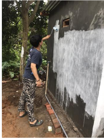
Fig. 3. Beautification project.