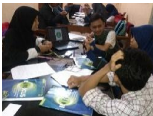
Fig. 4. Designing stickers.