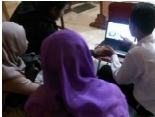
Fig. 1. Watching video.

Two key points in this step are to enhance the ability of the students to gather information, which is the basic of research skill, and to provide them an opportunity to discuss and execute their ideas which is the essence of leadership.