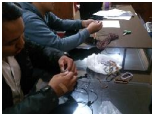
Fig. 3. Making bracelets.