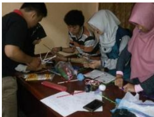
Fig. 2. Making flowers from straws.