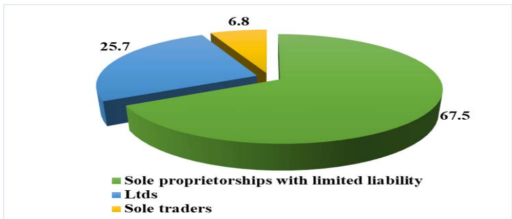
Fig. 1. Distribution of enterprises according to the form of registration.

In connection with a more comprehensive and accurate discussion of the problem, we believe that it is necessary to outline the profile of entrepreneurial business. The results of the business analysis according to the form of registration reveal that most significant is the share of sole proprietorships with limited liability (67.5%), followed by Ltds (25.7%) and sole traders (6.8%).