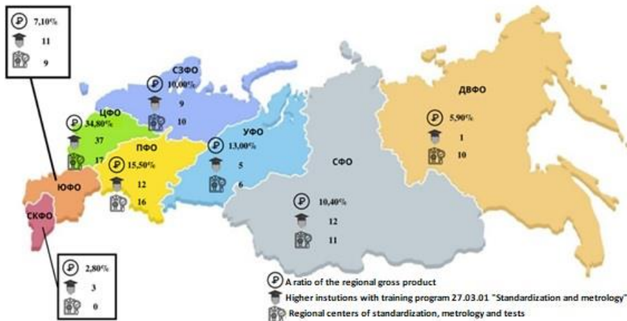
Fig. 1. Quantity of organizations (Higher institutions, CSMT) of federal districts of Russian Federation and the ratio of the regional gross product Where: C3ΦO – North-Western Federal District (NWFD); ЦΦO – Central Federal District (CFD); ЮΦO – Southern Federal District (SFD); CKΦO – North-Caucasian Federal District (NCFD); ΠΦO – Volga Federal District (VFD); УΦO – Ural Federal District (UFD); CΦO – Siberian Federal District (SFD); ДВΦO – Far Eastern Federal District (FEFD).

An amount of the organizations (HU, CSMT) of federal districts of Russian Federation and the ratio of the gross regional product are presented on Fig. 1.