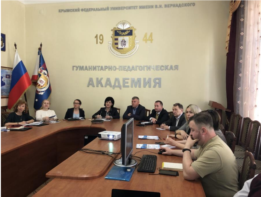
Fig. 2. Conference foto - conference participants.