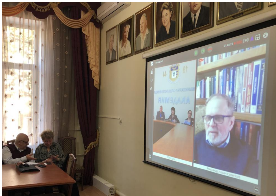
Fig. 4. Conference foto - -- online reports of conference participants.