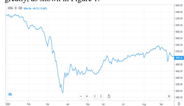
Fig 1. IDX Composite movement in 2020.

Entering the era of the COVID-19 pandemic in 2020, the movement of the IDX Composite Index fluctuated greatly, as shown in Figure 1.